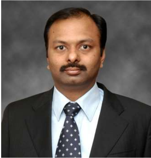
Senior Director, Data Management IQVIA, Bangalore